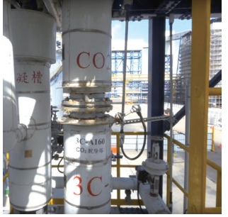
Tsing-Hua Univ. & China Steel Co. Chemical Absorption (0.1 t/d) & Adsorption (1.0 t/d)