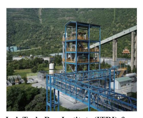
Ind. Tech. Res. Institute (ITRI) & Taiwan Cement Co. Calcium Looping Process (24 t/d)